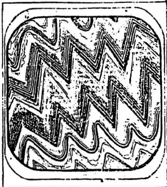
FROM - DAILY WORLD - Dec 69